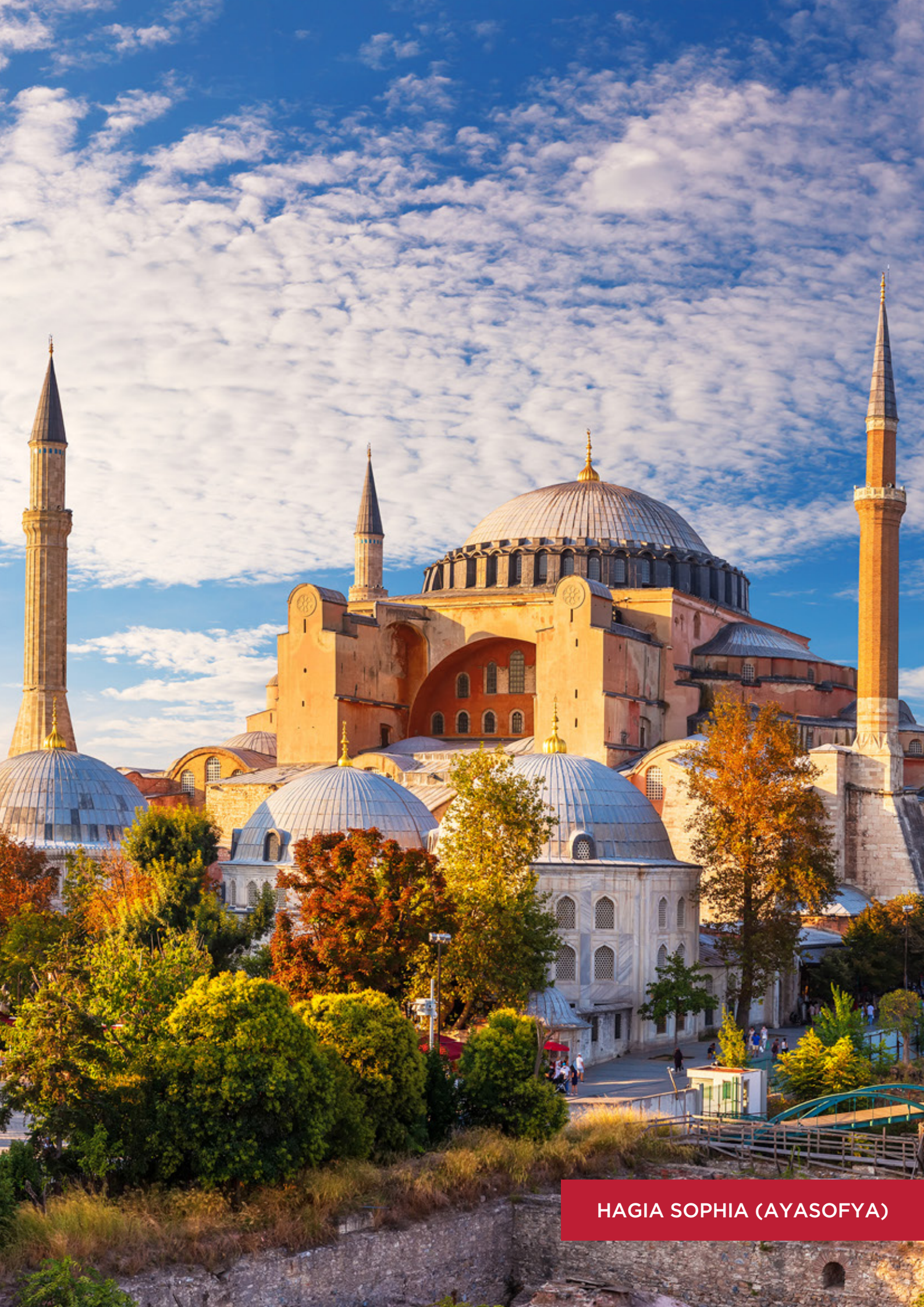
HAGIA SOPHIA (AYASOFYA)